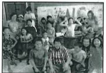
From top: Bible Camp in a Bag kits; Bible Camp in Inuvik; enjoying craft time in Cambridge Bay; pre-pandemic camp in Fort Liard.