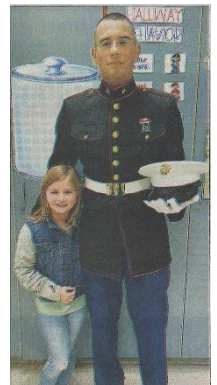
Local Man Graduates United States Marine Corps Boot Camp