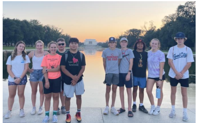
St Matthew, St Luke, & Laurel Trinity Youth Sunset on the way to the Lincoln Memorial

When the Gathering was cancelled, the Allegheny Synod asked the Synod's youth team to plan an alternative event for our senior high school youth. A few congregations decided to plan trips on their own, but appreciating the way Synod events enrich our connection to the wider Church, St. Matthew chose to work with St. Luke Roaring Spring, Laurel Trinity Jennerstown, and Grace State College to plan a trip to Washington DC and Caroline Furnace Lutheran Camp, the outdoor ministry site of the Virginia Synod.