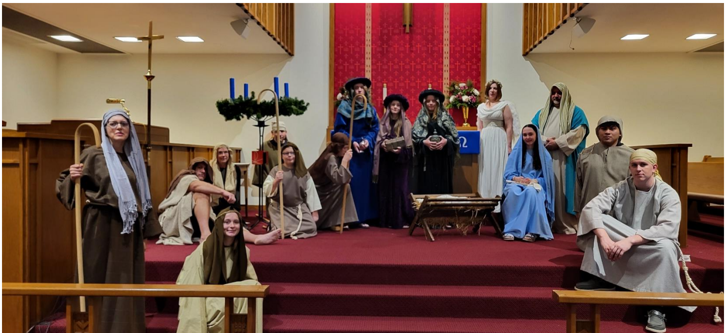
Manger scene – modified presentation