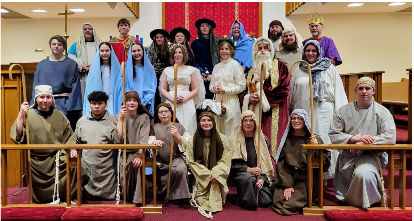
2024 Journey to Bethlehem Cast

The congregation has not presented Journey to Bethlehem since 2019—the pandemic restrictions necessitated a 5-year break in the every-other-year routine of presentations. The cast members were all veterans to the Journey; however, some roles were changed. All the little angels and shepherds that used to float from shepherd field to shepherd field were now in major speaking roles. I found that to be quite incredible.