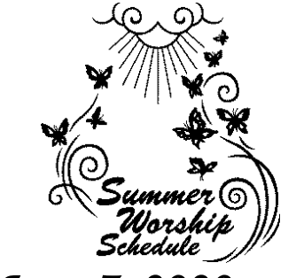
Starts, June 7, 2020 at 9:30 a.m.